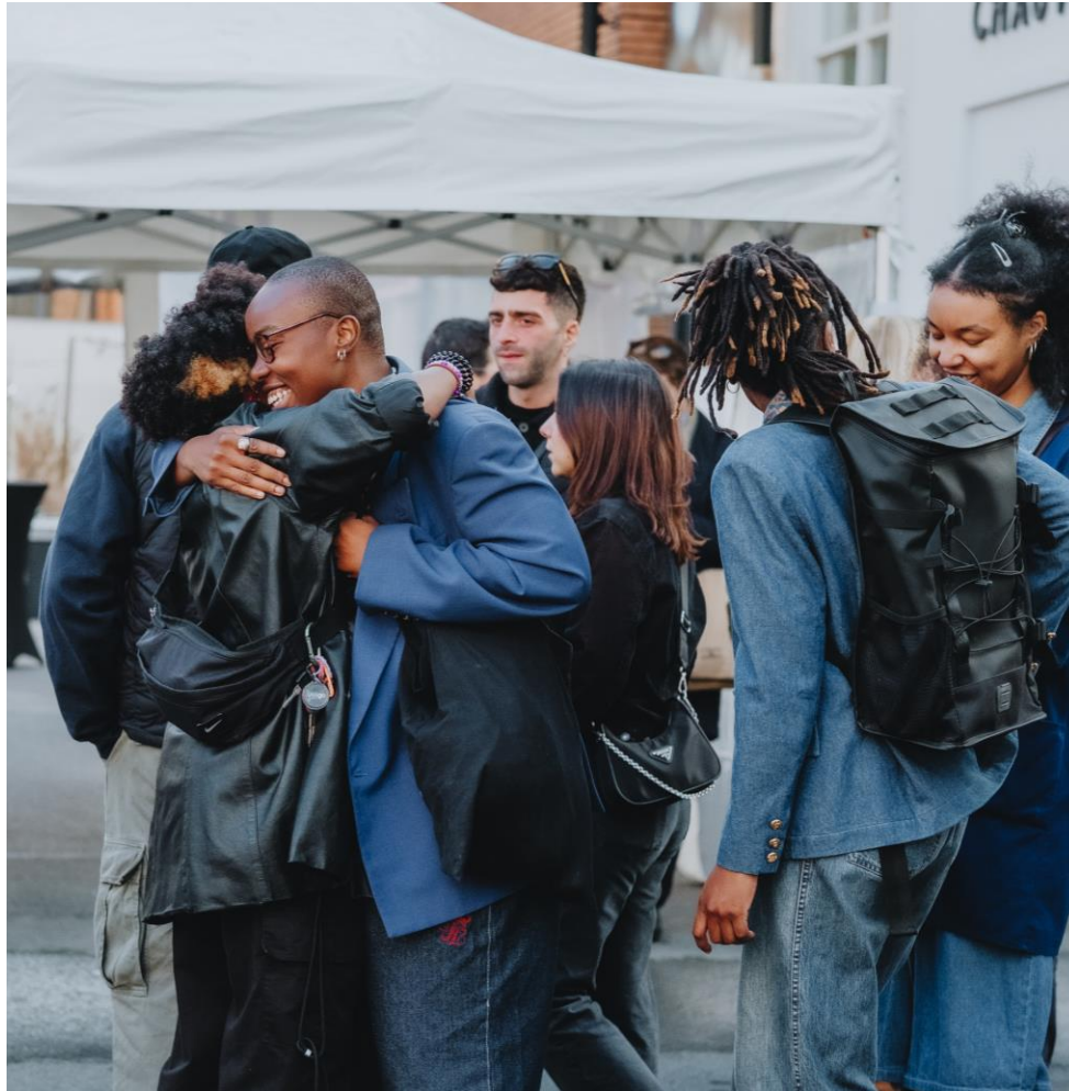
View of the exhibition opening, Gunaikēion 40 ans du Frac, 2023

These events are organized and validated in close collaboration with the Fondation Fiminco team (contextualization, budget, production, communication and mediation). Candidates are required to design and write one or more presentation texts, and to be present at the event.