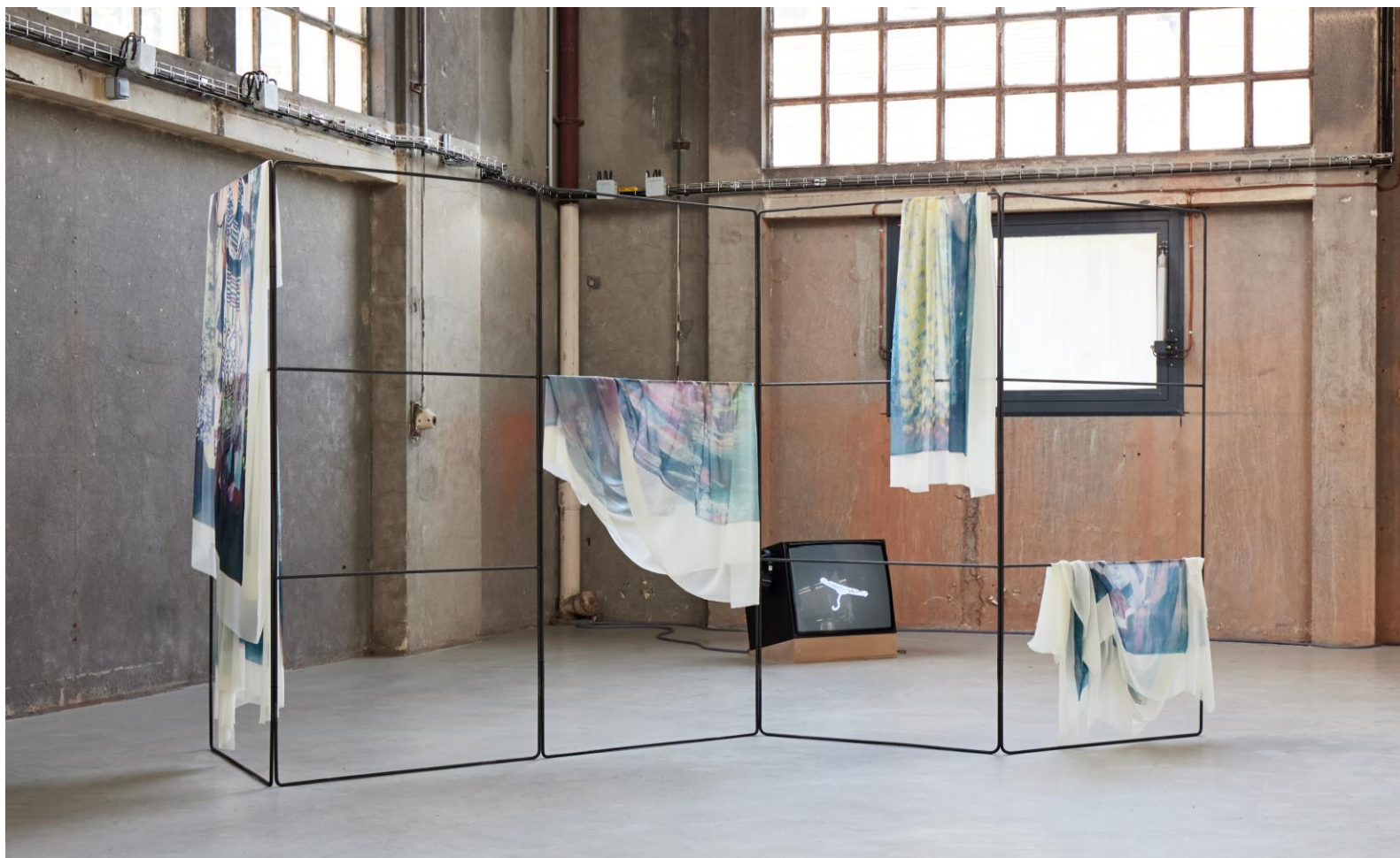
View of the exhibition Odysées Urbaines, 2023

The Fiminco Fondation residency is intended to help artists and curators gain visibility on the French art scene and become part of a cultural network. The curator will be supported by the foundation's team throughout the residency.