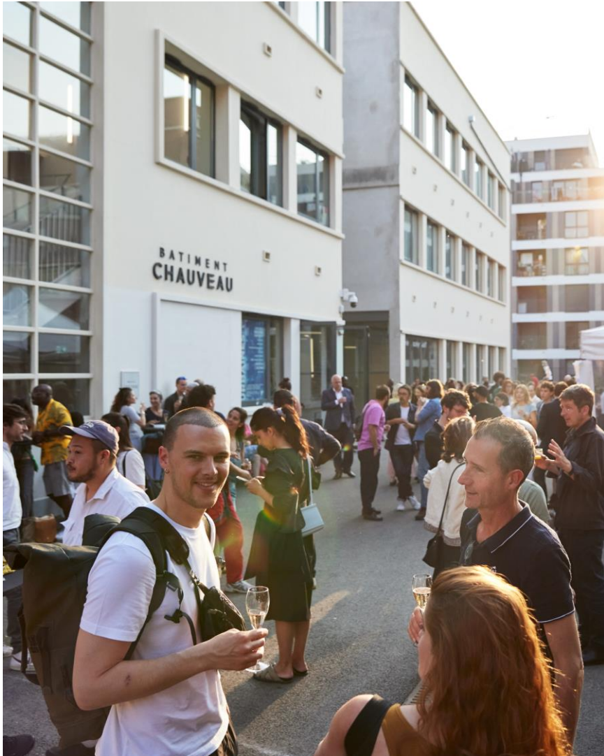
View of the exhibition opening, Gunaikeïon 40 ans du Frac, 2023

By relying on the multi-disciplinarity of art forms and research, the Fondation Fiminco also intends to create connections between different art scenes and offer curators in residence the opportunity to situate their work with other creative contexts.