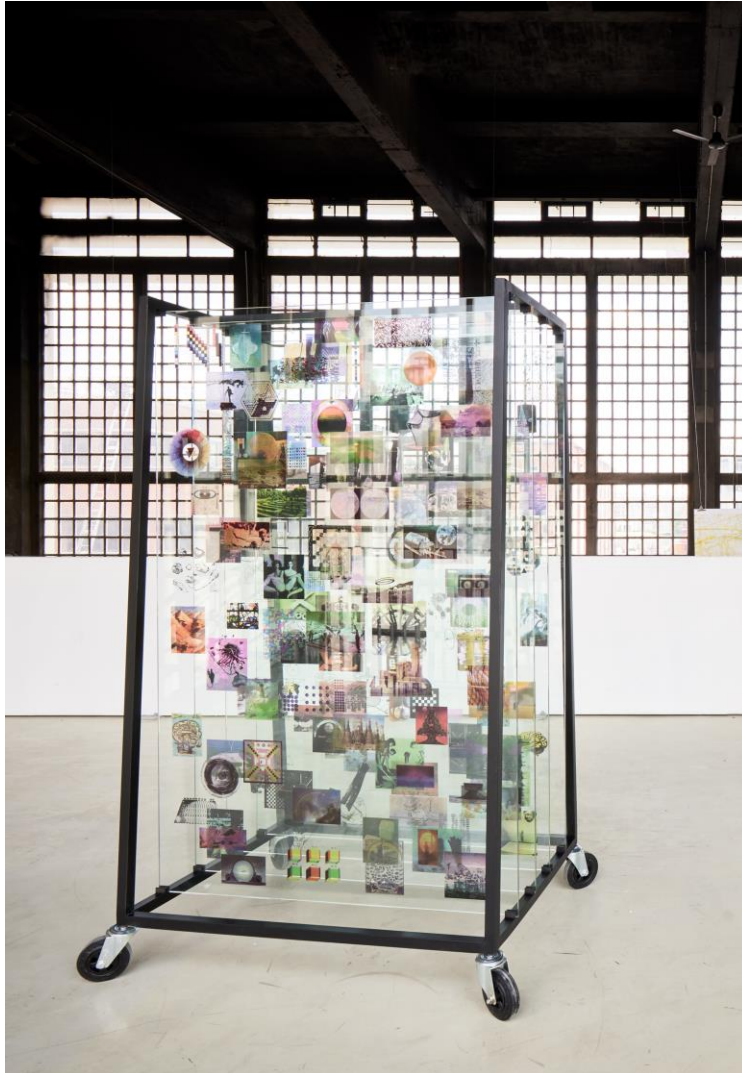
View of the exhibition Odyssées Urbaines, 2023 Artiste - Marielle Chabal