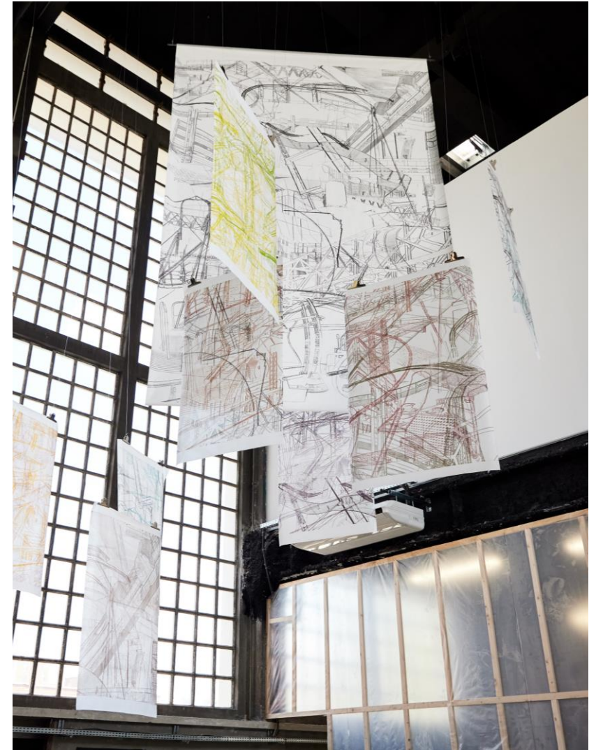
© Andreas B. Krueger, View of the exhibition Odyssees Urbaines , 2023 Artiste - Timo Herbst