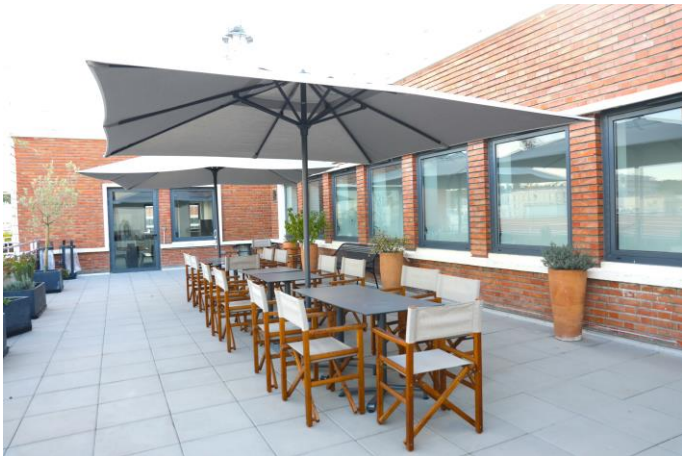
Terrace of the residence

A residency agreement will be signed on the residents' arrival on the premises. The rules of the residency are available on the foundation's website.