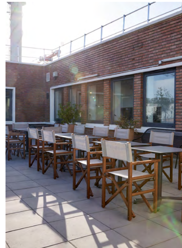
The terrace of the residence

An exceptional exhibition space (1,300 m 2 ) with impressive high ceilings (14 m).