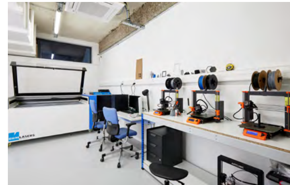
Photo and video workshop

Three 3D FDM plastic printers, 2 SLA resin printers, laser cutting