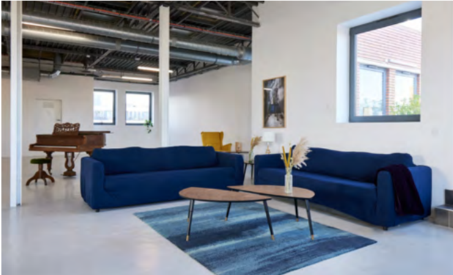
Shared lounge