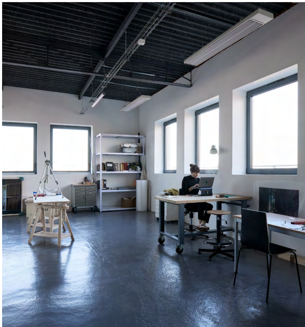
Collective workshop