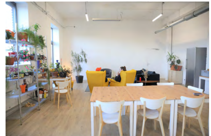
© Fondation Fiminco / shared kitchen