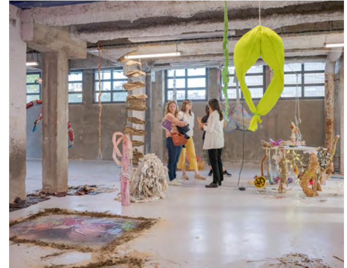
View of the exhibition Plein Feux #2 , 2021

Designed to be a time of reflection and experimentation, the exhibition marks the end of their residency.