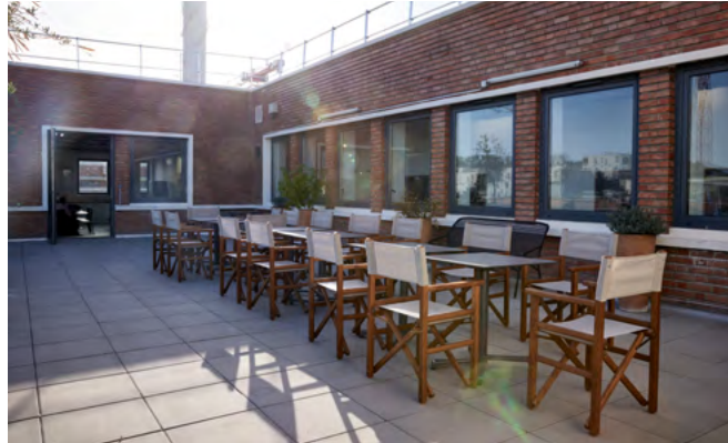
Terrace

Each resident artist has a furnished studio with a private bathroom as well as a shared kitchen, equipped and open on a terrace.