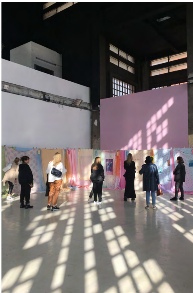
Mégane Brauer, J'ai essayé d'être gentille, mais ça me tue de l'intérieur , 2020, view of the exhibition De toi à moi , 2022