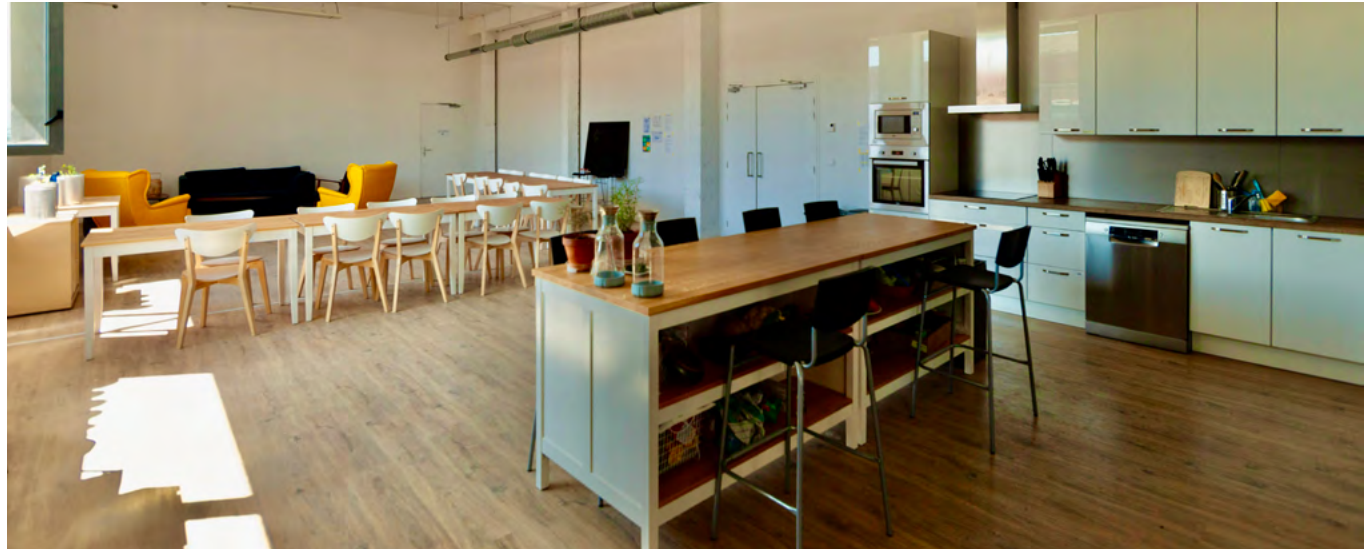
Shared kitchen