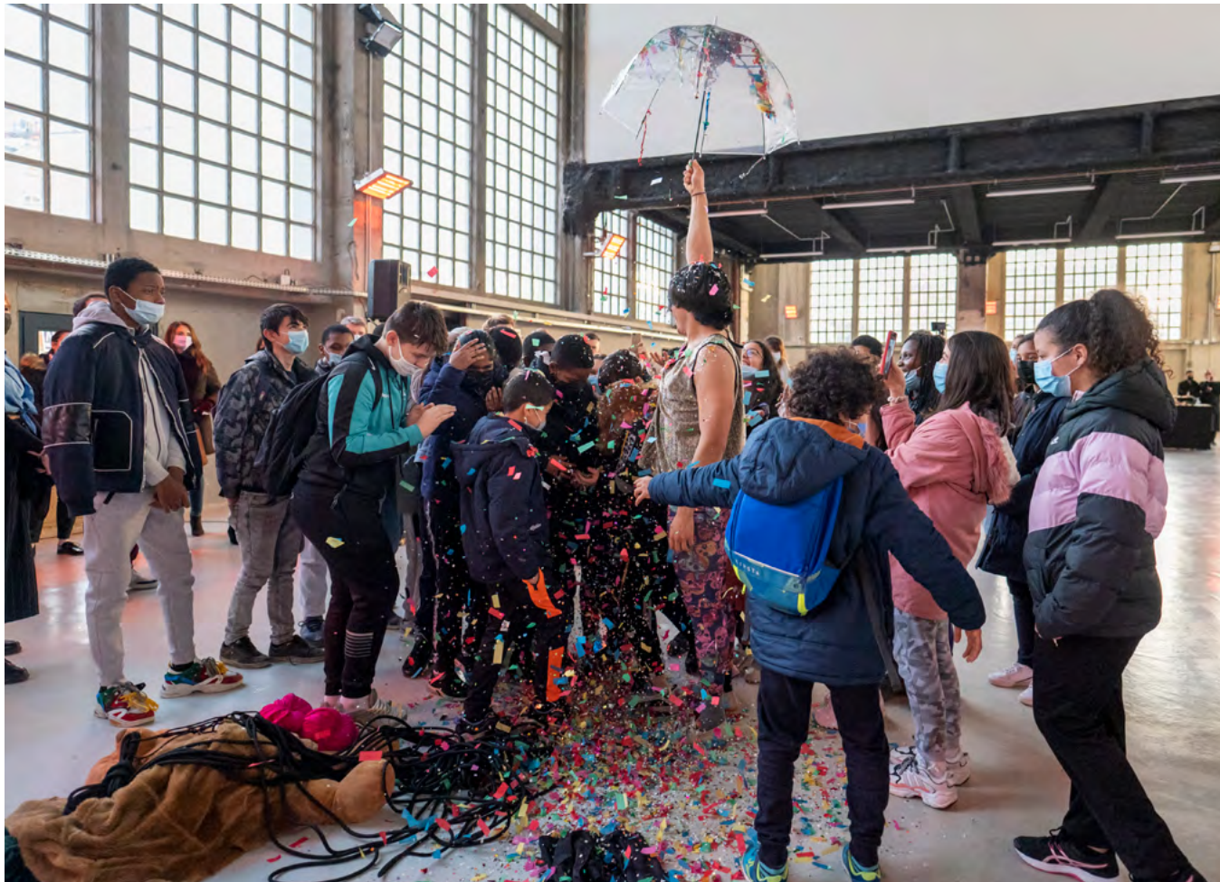
Inauguration of the Micro Folie, Fondation Fiminco, 2021

Throughout the year, the Fondation Fiminco organizes a range of free events (exhibitions, performances, talks, art history courses...) for a broad audience. Conceived as a venue for building awareness of contemporary art, open to its surroundings, all the residents are encouraged to develop exchanges with visitors.