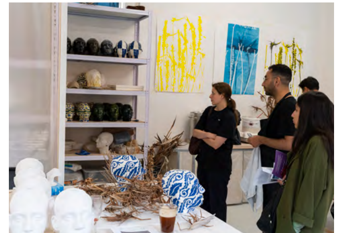
Open Studio 2022