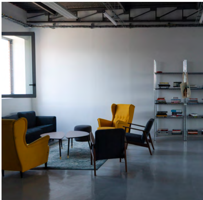
Shared living space inside the residency

The file should be sent by email only to: residency@fondationfiminco.com before January 21 st , 2021