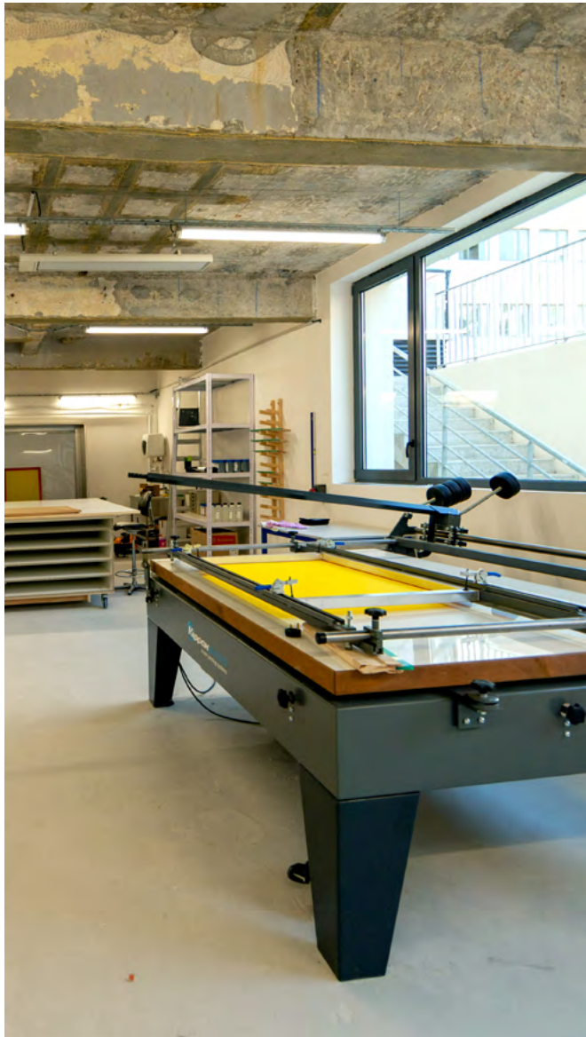
Silkscreen studio