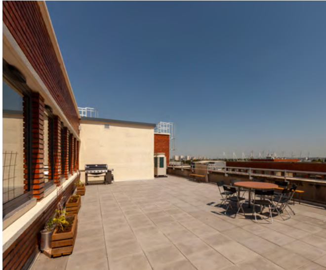
Terrace of the residency