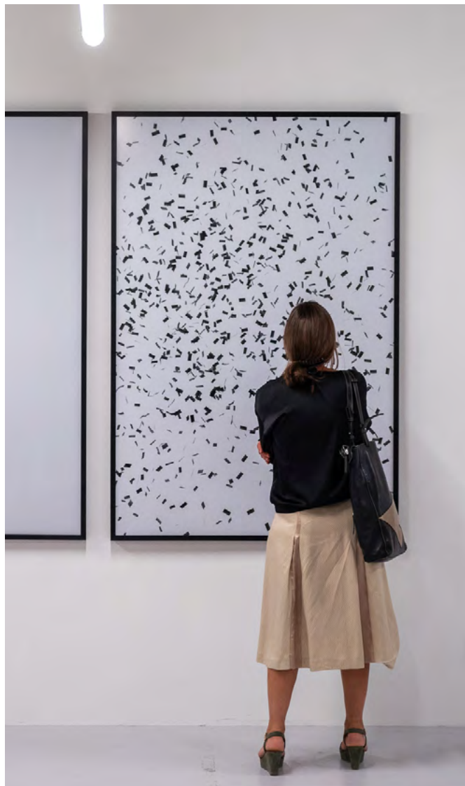
NOH Suntag, Demagogy #BJC1501 , 2009 Vue de l'exposition Negotiating Borders , Fondation Fiminco, 2020

With this in mind, the Fondation has, this year, partnered with the regional institution Est Ensemble and the regional government of Seine-Saint-Denis to encourage the development of arts and cultural education projects in schools and cultural facilities within the region. These partnerships allow artists-in-residence who wish to participate to have meetings with the public, conduct workshops on an ad-hoc basis, or to propose a longer-term cultural project, in conjunction with the Fondation and its partners.