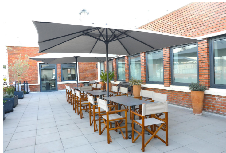
Terrace of the residence