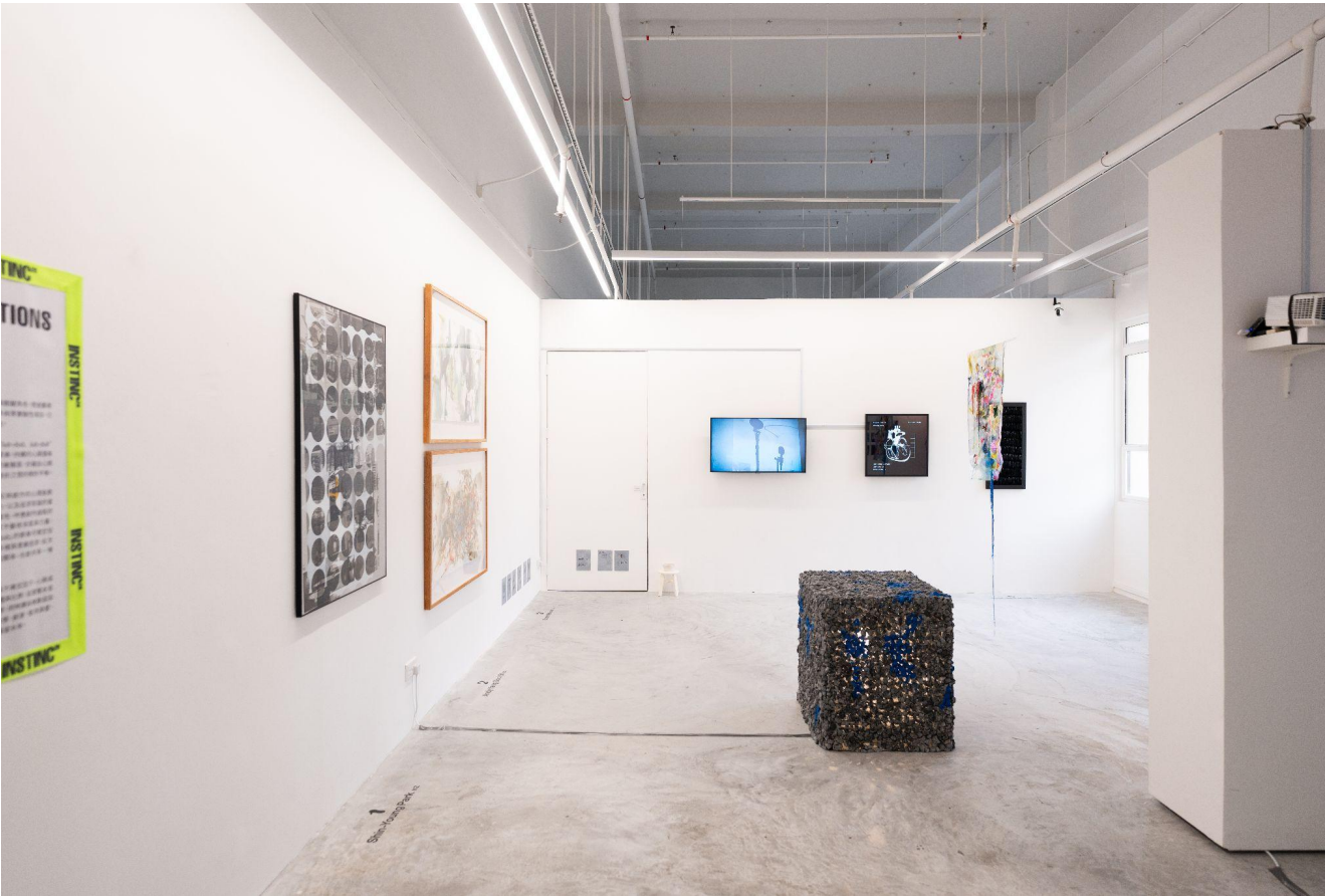
INSTINC Gallery, Tanjong Pagar Distripark, 2025

Founded in 2004, INSTINC stands as a leading artist-run-institution based in Singapore.