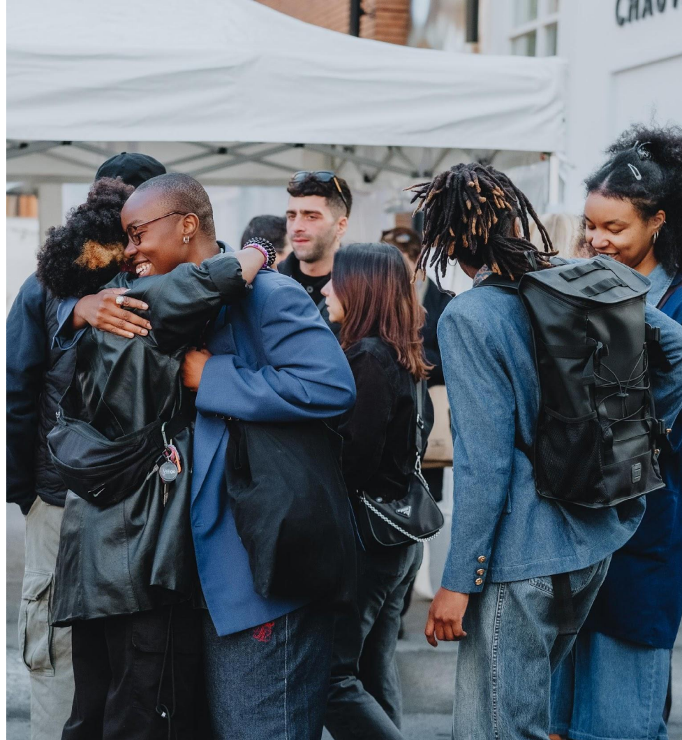
© Manuel Abella, View of the exhibition opening, Gunaikeion 40 ans du Frac, 2023

The Fondation also offers cultural field trips to help residents discover new places and practices of contemporary creation in the Île-de-France region.