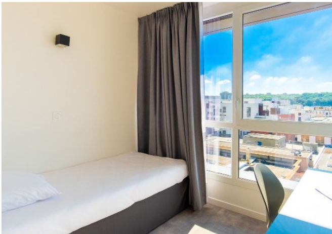
single bed and desk FAST building

On the arrival and departure of the artist, a joint inventory of fixtures is carried out. Residents undertake to use the various premises at their disposal in a peaceful manner, maintaining them in good condition, and to report any problems observed. The Fondation Fiminco residency's accommodation is non-smoking and cannot accommodate pets.