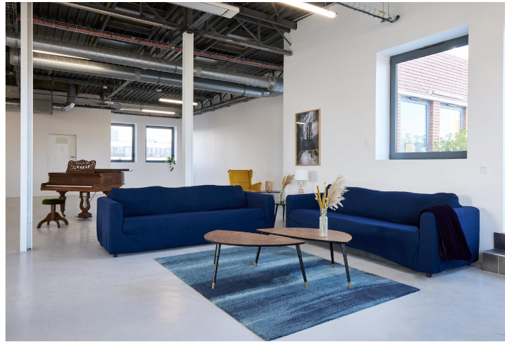
© Andreas B. Kruger / shared lounge