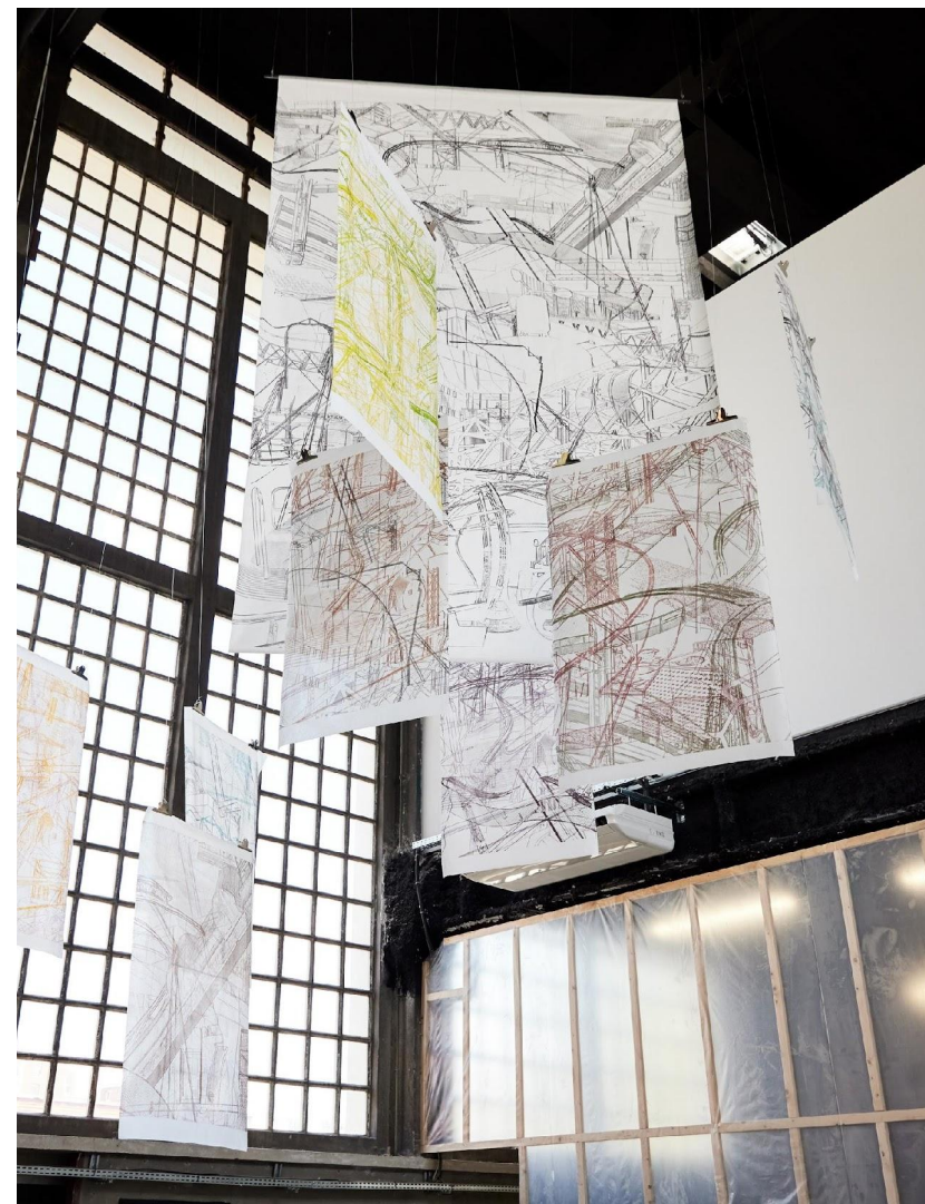
© Andreas B. Krueger, View of the exhibition Odyssées Urbaines, 2023 Artiste - Timo Herbst