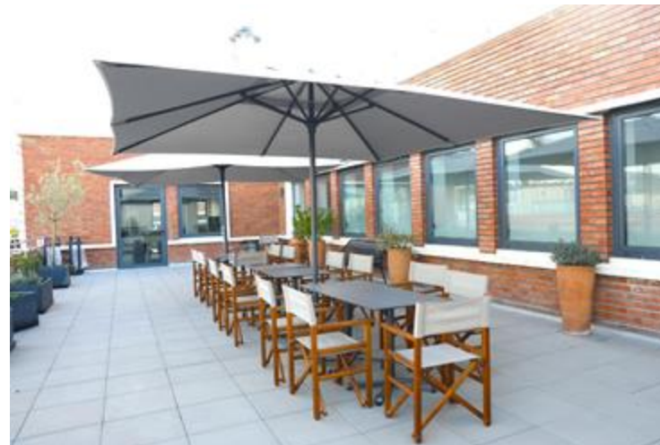
Terrace of the residence