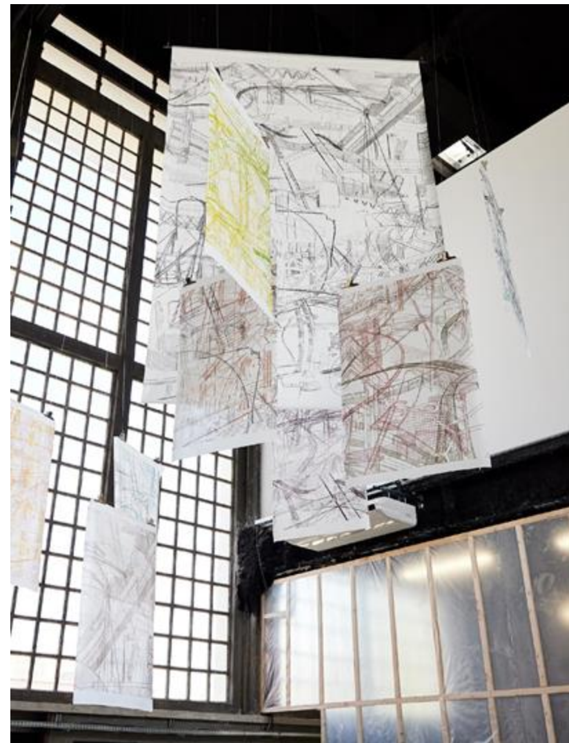
View of the exhibition Odyssees Urbaines, 2023 Artiste - Timo Herbst