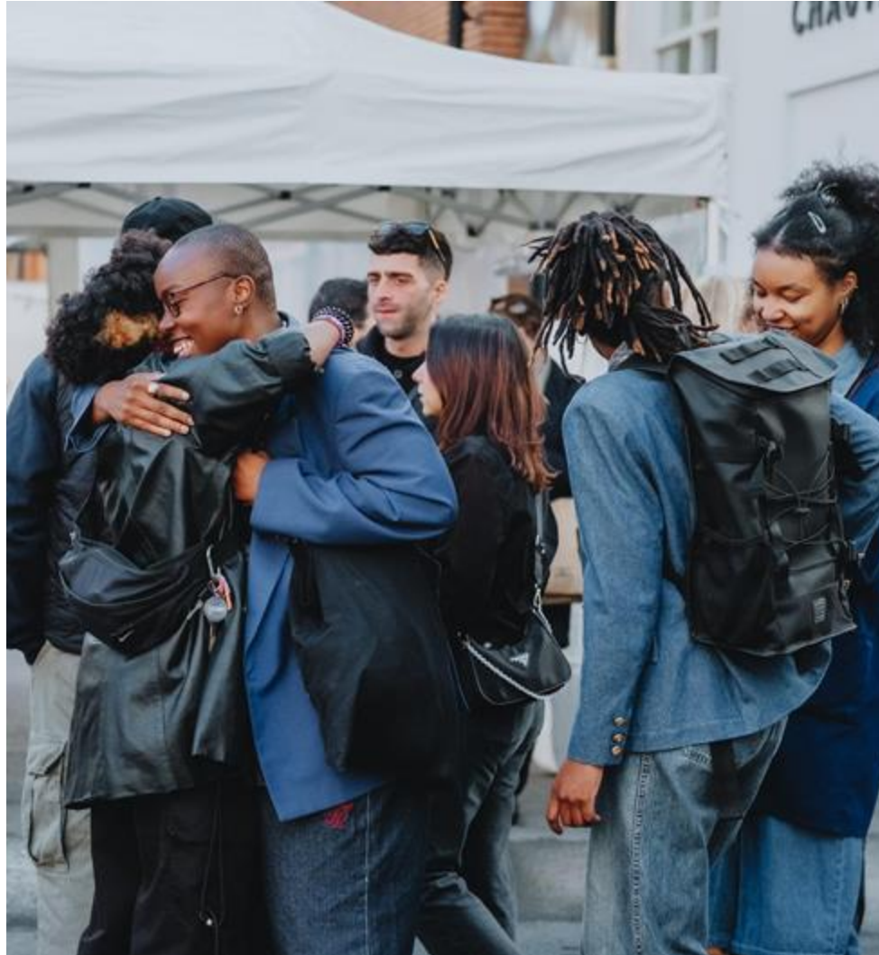
View of the exhibition opening, Gunaikéion 40 ans du Frac, 2023

The Fondation also offers cultural field trips to help residents discover new places and practices of contemporary creation in the Île-de-France region.