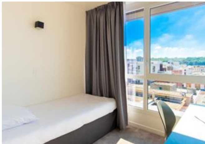
single bed and desk FAST building

On the arrival and departure of the artist, a joint inventory of fixtures is carried out. Residents undertake to use the various premises at their disposal in a peaceful manner, maintaining them in good condition, and to report any problems observed. The Fondation Fiminco residency's accommodation is non-smoking and cannot accommodate pets.